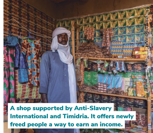
A shop supported by Anti-Slavery International and Timidria. It offers newly freed people a way to earn an income.

breaking the cycle of slavery. Together, we raise awareness about the rights of individuals, fostering a culture of empowerment and freedom.