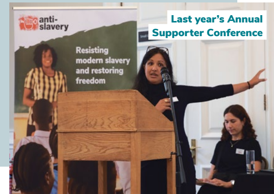
Last year's Annual Supporter Conference

Don't miss out! Email supporter@antislavery.org to secure your tickets. Let's gather to celebrate, connect and empower each other in our mission to eradicate modern slavery. We can't wait to see you there!