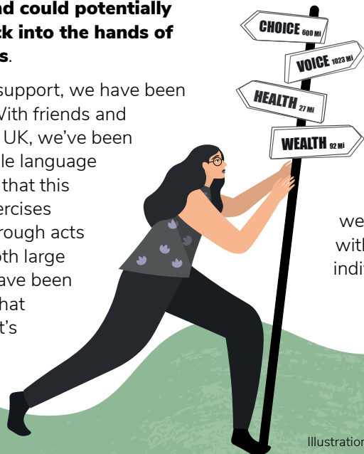
Illustration: Faltrego for Anti Slavery International

Incredible supporters like you have added your voices to the chorus. A resounding nearly 17,000 of you spoke out with an emphatic 'NO' to the cruel and inhumane 'Illegal Migration' Act. Over 600 of you reached out to your MPs, making sure your concerns are heard loud and clear. Buoyed by your emails in support of our campaign, we have spoken with a number of individual MPs.