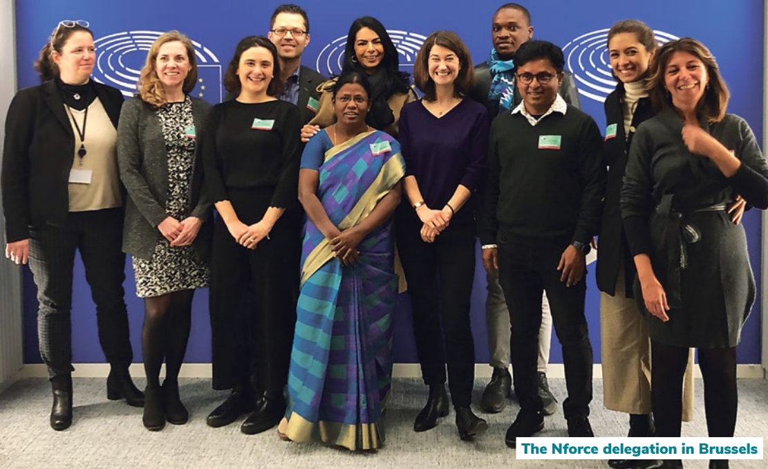
The Nforce delegation in Brussels